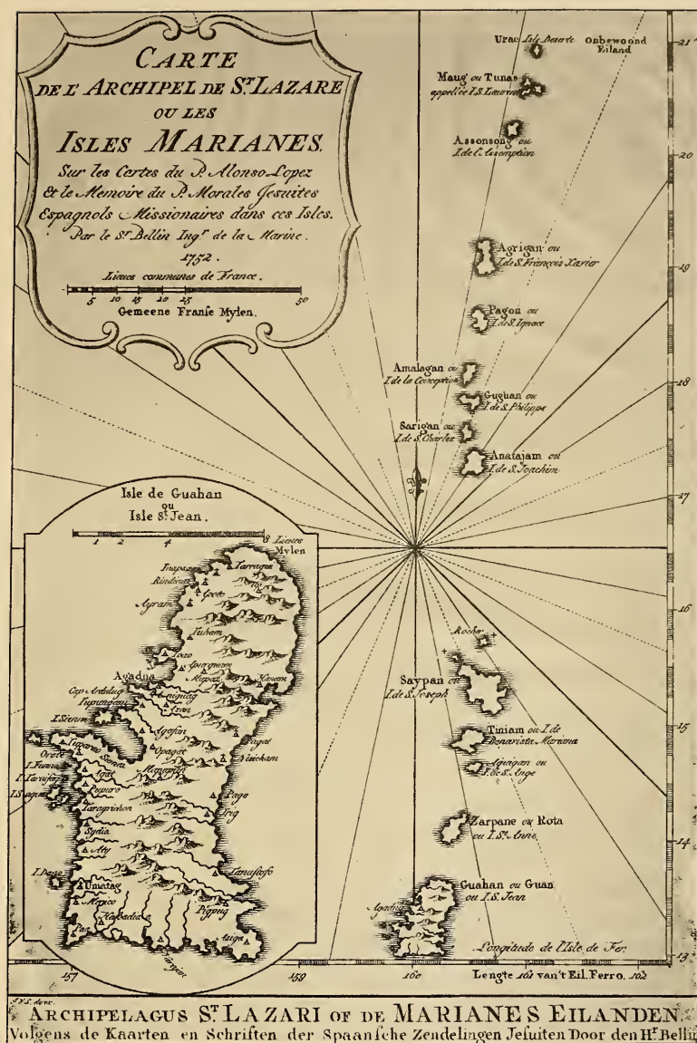
Map of the Marianas Islands (with large inset of the island of Guam); from Bellin's map in Historische Beschryving der Reizen (Amsterdam, 1758)

[From copy in library of Wisconsin Historical Society]